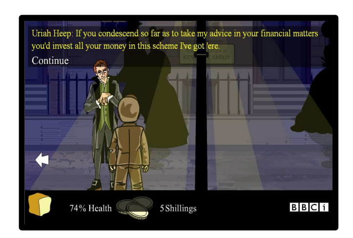
Figure 2. Surviving Charles Dickens' London Game